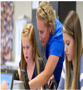
Sossaman teacher selected as Queen Creek Chamber