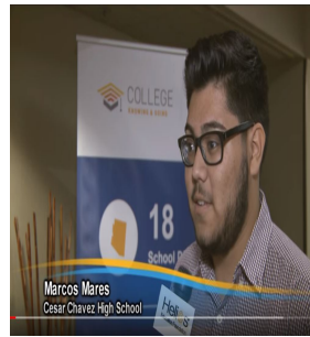
Video: Helios is helping to build a college going culture at high