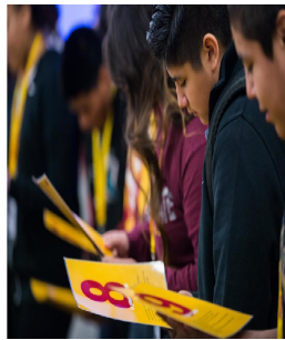
Conference aims to help American Indian students prepare for